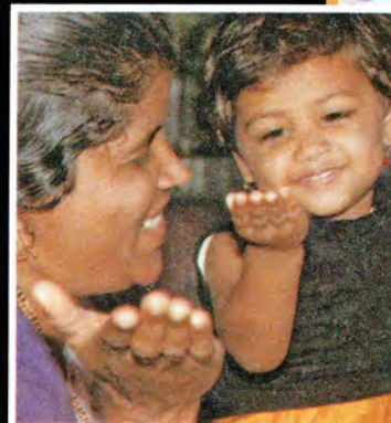
God's people rejoice. Top, Rapid City, S.D. Second row left, Regina, Sask. right, Norfolk, Va. Above, Ulladulla, Australia. Left, Goa, India.